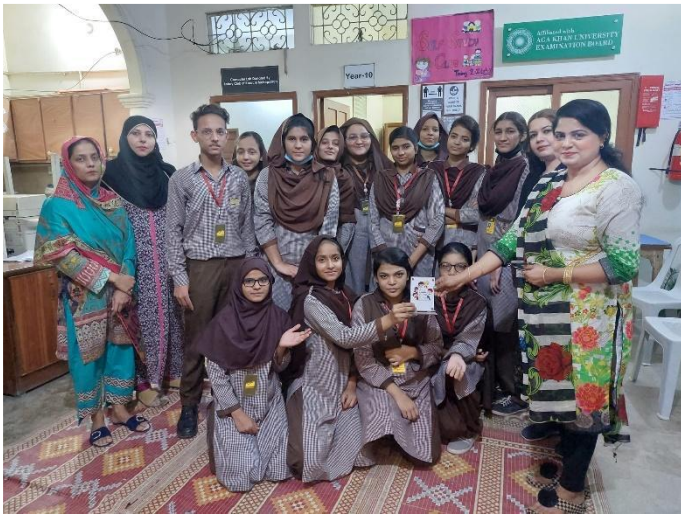
Mental Math competition participants at Rahnuma!